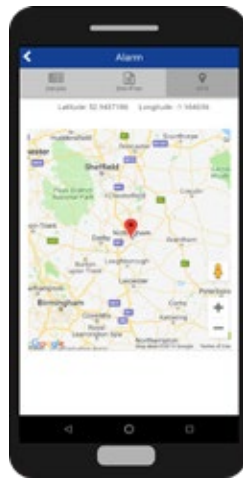
REACT app for smartphones and tablets

The REACT app is available to admin users and personnel. This is used to create alerts, ranging from Fire alerts to Water Damage, Hazard warnings to the Lone Worker feature - the latter being ideal for keeping the safety of individuals who commonly work alone in check. Information from the app, including the ability to add photographs in real-time, is then sent via SMS, Mobile and Email options to those who need to know.